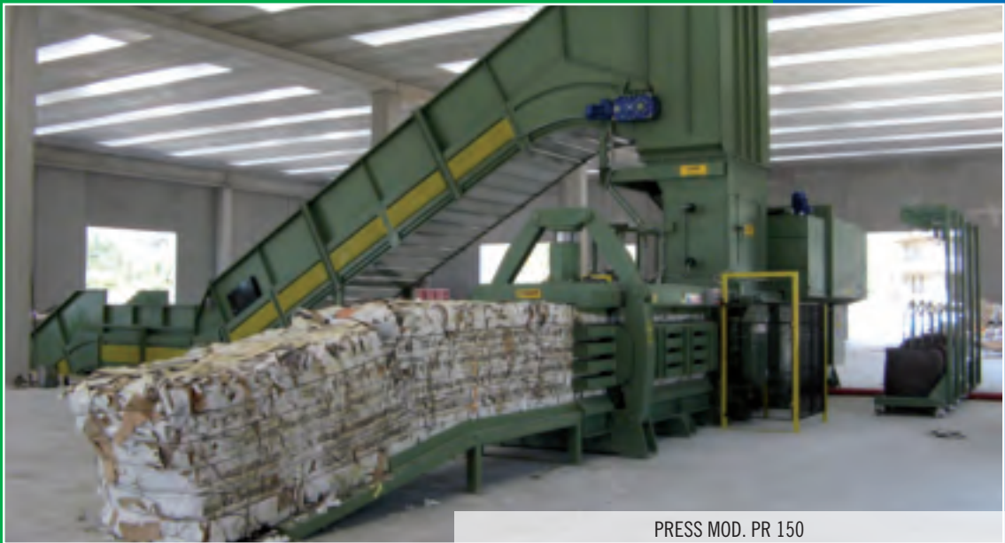
PRESS MOD. PR 150