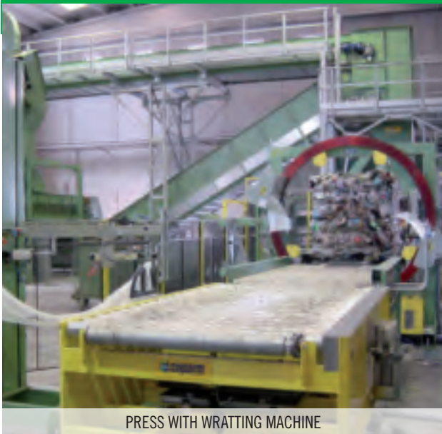
PRESS WITH WRAPPING MACHINE