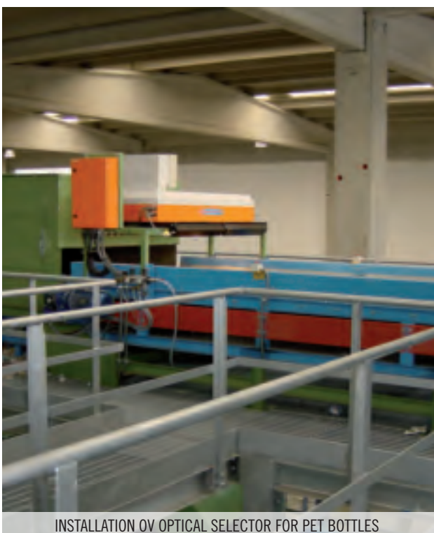
INSTALLATION OV OPTICAL SELECTOR FOR PET BOTTLES