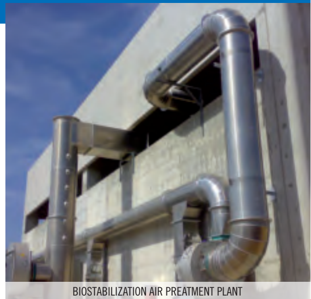
BIOSTABILIZATION AIR TREATMENT PLANT