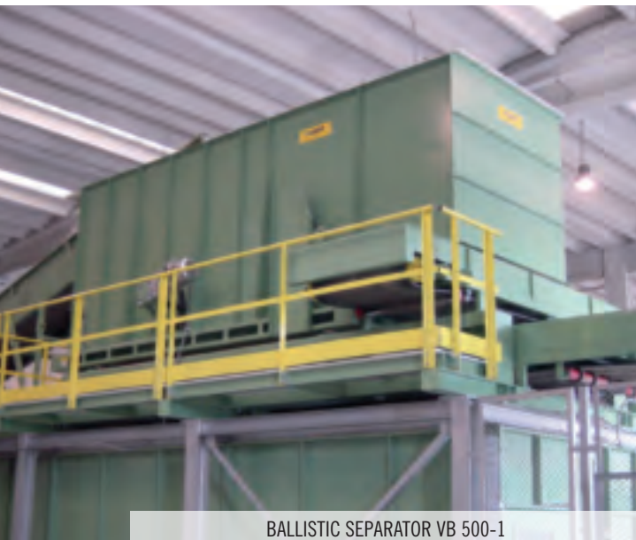
BALLISTIC SEPARATOR VB 500-1