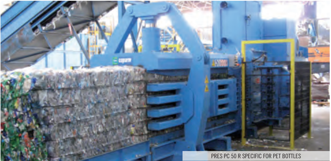
PRES PC 50 R SPECIFIC FOR PET BOTTLES