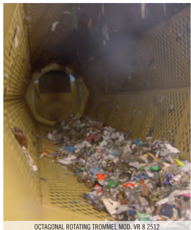
OCTAGONAL ROTATING TROMMEL MOD. VR 8 2512