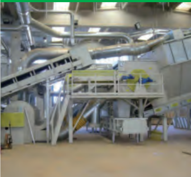
AIR SEPARATOR FOR LIGHT FRACTION