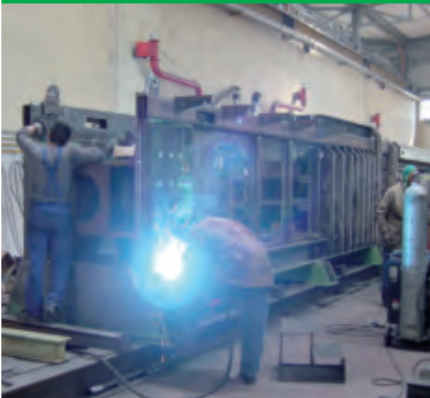
PRESS PR 225