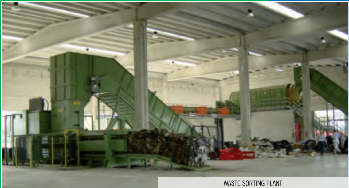
WASTE SORTING PLANT