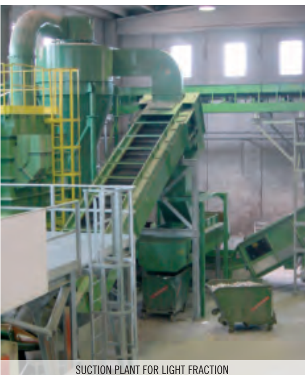
SUCTION PLANT FOR LIGHT FRACTION