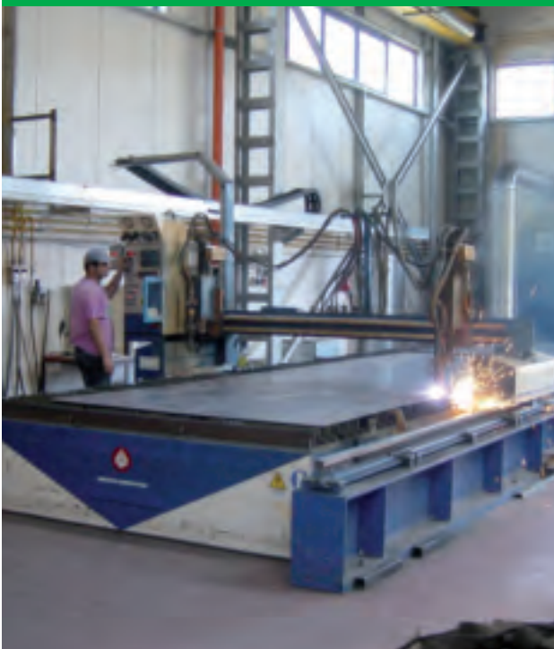
CNC OXYGEN CUTTING PLANT