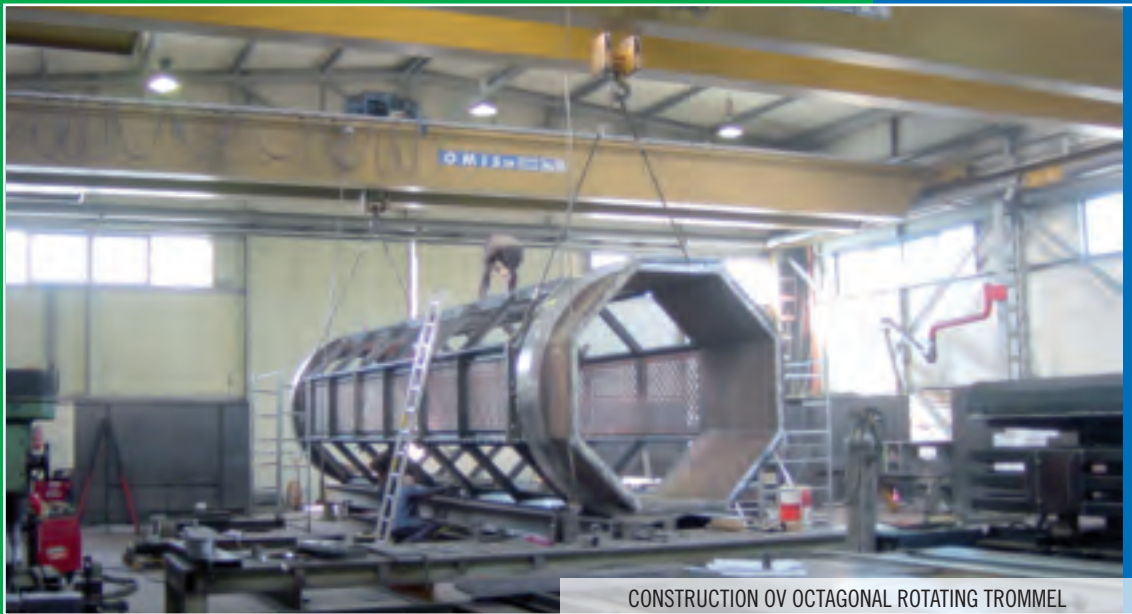
CONSTRUCTION OV OCTAGONAL ROTATING TROMMEL