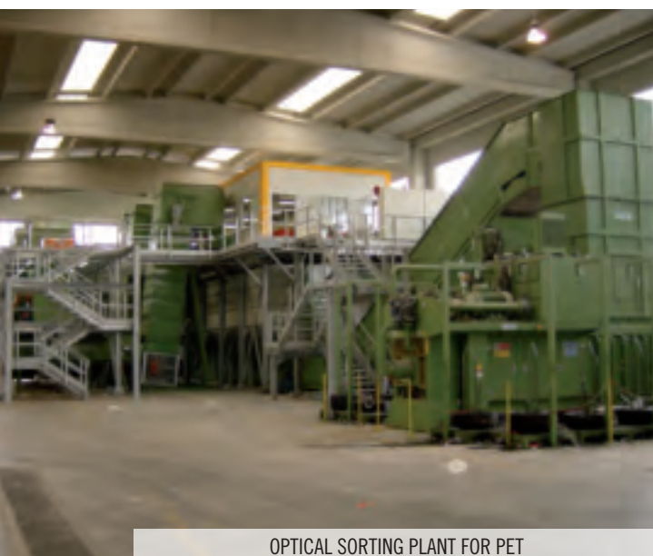
OPTICAL SORTING PLANT FOR PET