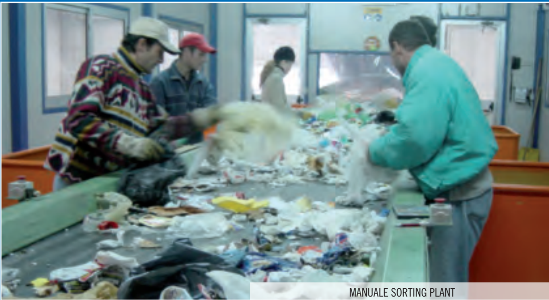
MANUALE SORTING PLANT